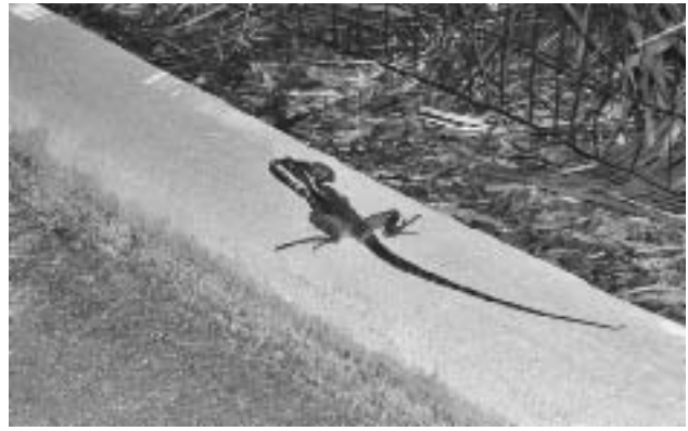
Juvenile Brown Basilisk ( Basiliscus vittatus ) on a palm at Crandon Park, Key Biscayne, Miami-Dade County.