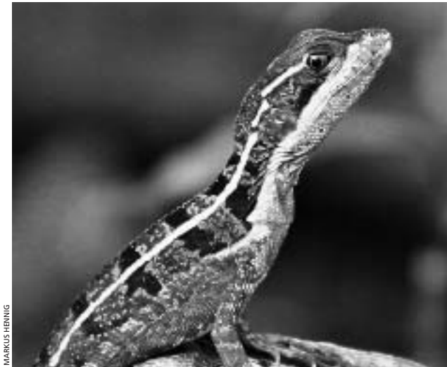
Juvenile Brown Basilisk ( Basiliscus vittatus ) on a Brazilian Pepper ( Schinus terebinthifolius ) stump at Vanderbilt Beach County Park, Collier County.

Gravid female Basiliscus vittatus have been found from March through July in Florida, and a gravid female collected in June oviposited a second clutch in October (Meshaka et al. 2004). Elaphe guttata , Black Racers ( Coluber constrictor ), and Eastern Indigo Snakes ( Drymarchon couperi ) are reported to have been observed eating juvenile B. vittatus (see Meshaka et al. 2004).