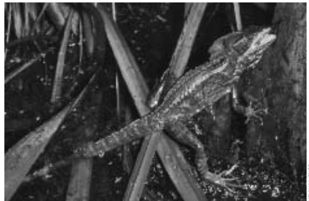
KEVIN M. ENGE

In Miami-Dade County, Basiliscus vittatus is known to feed on beetles (including the Eyed Elator, Alaus oculatus ), roaches, ants, hemipterans, and Ficus fruits (Meshaka et al. 2004). At Vanderbilt Beach County Park in Naples, Collier County, one of us (JCS) observed B. vittatus pursuing and eating large insects and arachnids 2.4–3.0 m away, as well as two B. vittatus fighting over a captured Anolis sagrei . At this site, we have used domestic crickets, as well as locally collected Wood ( Sesarma cinereum ) or Fiddler ( Uca pugilator ) crabs as bait on fishing rods to collect B. vittatus .